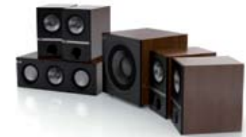
Q100 5.1 Package.