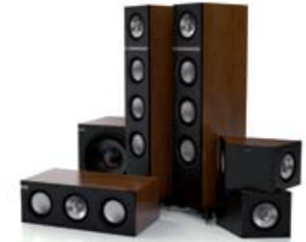
Q500 5.1 Package.