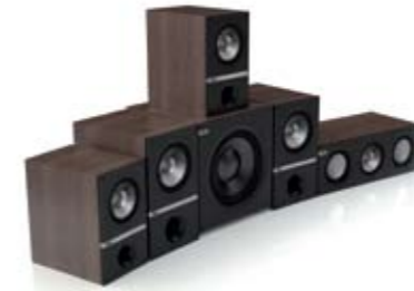
Q300 5.1 Package.