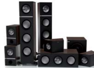
Q700 7.1 Package.