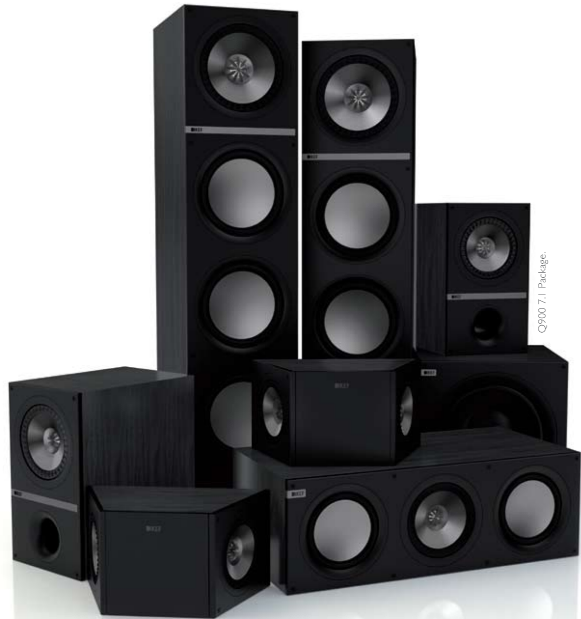
Q900 7.1 Package.